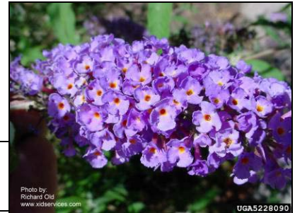
Purple flowers, often with orange centers